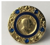
The PHF+5 pin has 5 blue sapphires.