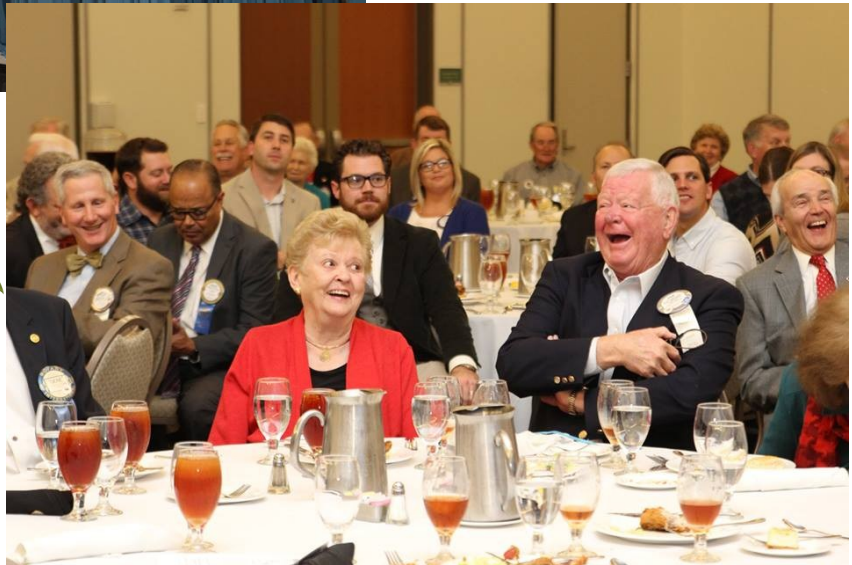
Anyone enjoy the program? Check out those chuckles!